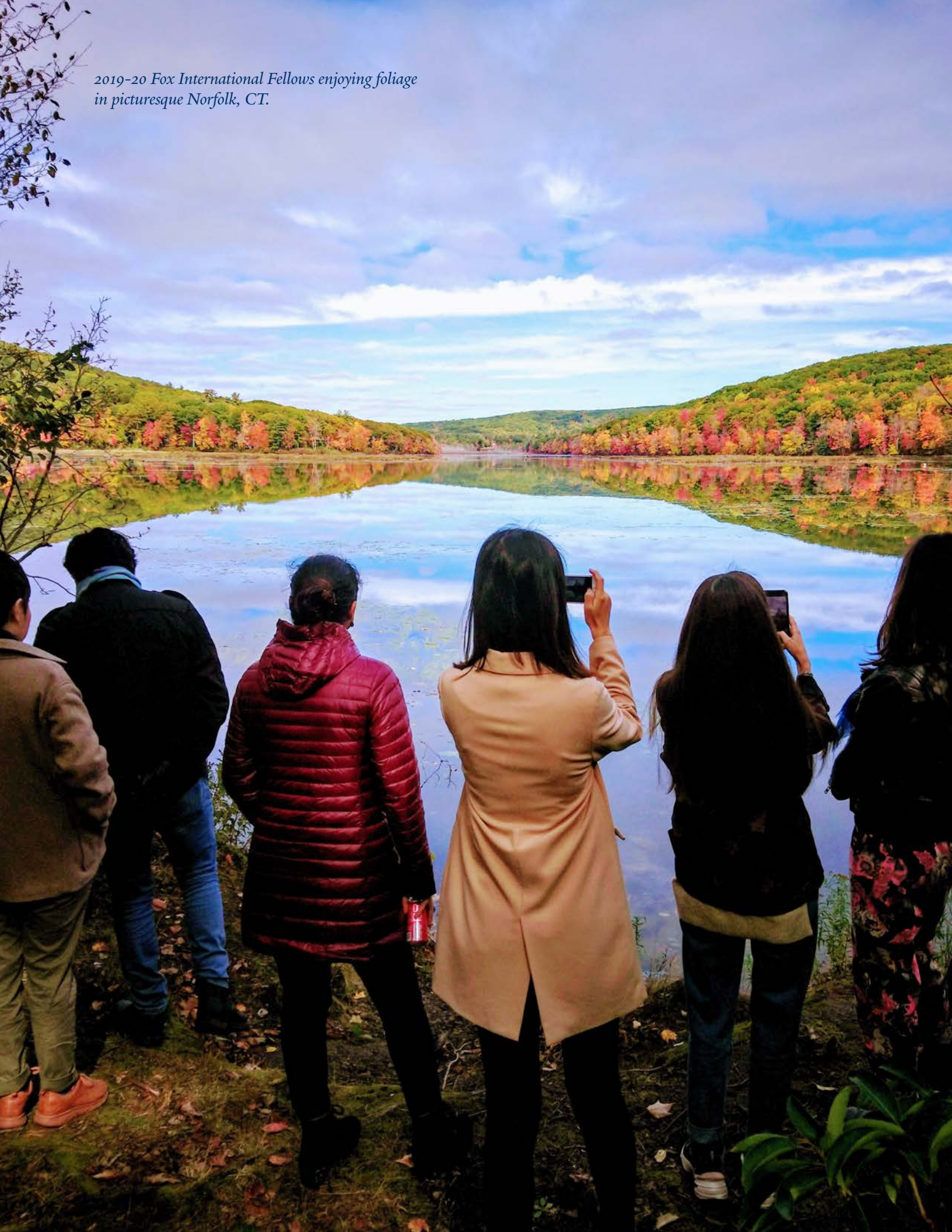
2019-20 Fox International Fellows enjoying foliage in picturesque Norfolk, CT.