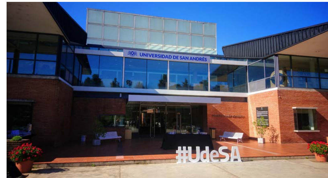
Universidad de San Andrés, Victoria Campus

This year's Fox International Fellowship annual report is an account of what the program accomplished in the year cut short by the pandemic and the following year, in which the pandemic upended everyday life and international travel. We document how the program and our fellows were able to continue our mission of fostering scholarship with the potential to offer practical solutions to the problems that stand in the way of the world's peace and prosperity. What we accomplished is a testament to the dedication and resilience of the program's staff, our colleagues within Yale's departments, and the Fox Fellows themselves.