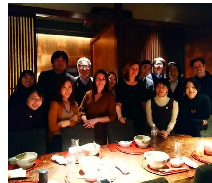
Mini-Reunion in Tokyo, Japan

In December 2019, Waseda University and Yale formally signed a memorandum of understanding establishing Waseda as the twenty-first global exchange partner for the fellowship. Waseda University is a leader in international education in Japan and a prestigious research university in its own right. We look forward to continuing this productive collaboration in the years to come. As a part of the visit we hosted a mini Fox reunion with Fox alumni from Tokyo University.