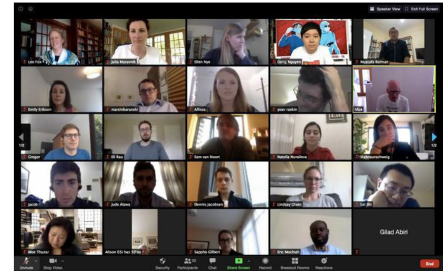
Farewell gathering during the statewide quarantine.