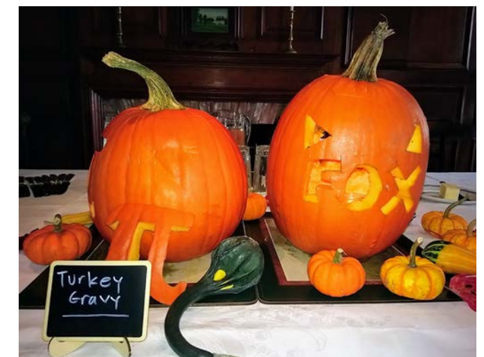
◀ Thanksgiving at the Fox family home at Wood Creek Farm in Norfolk, CT.