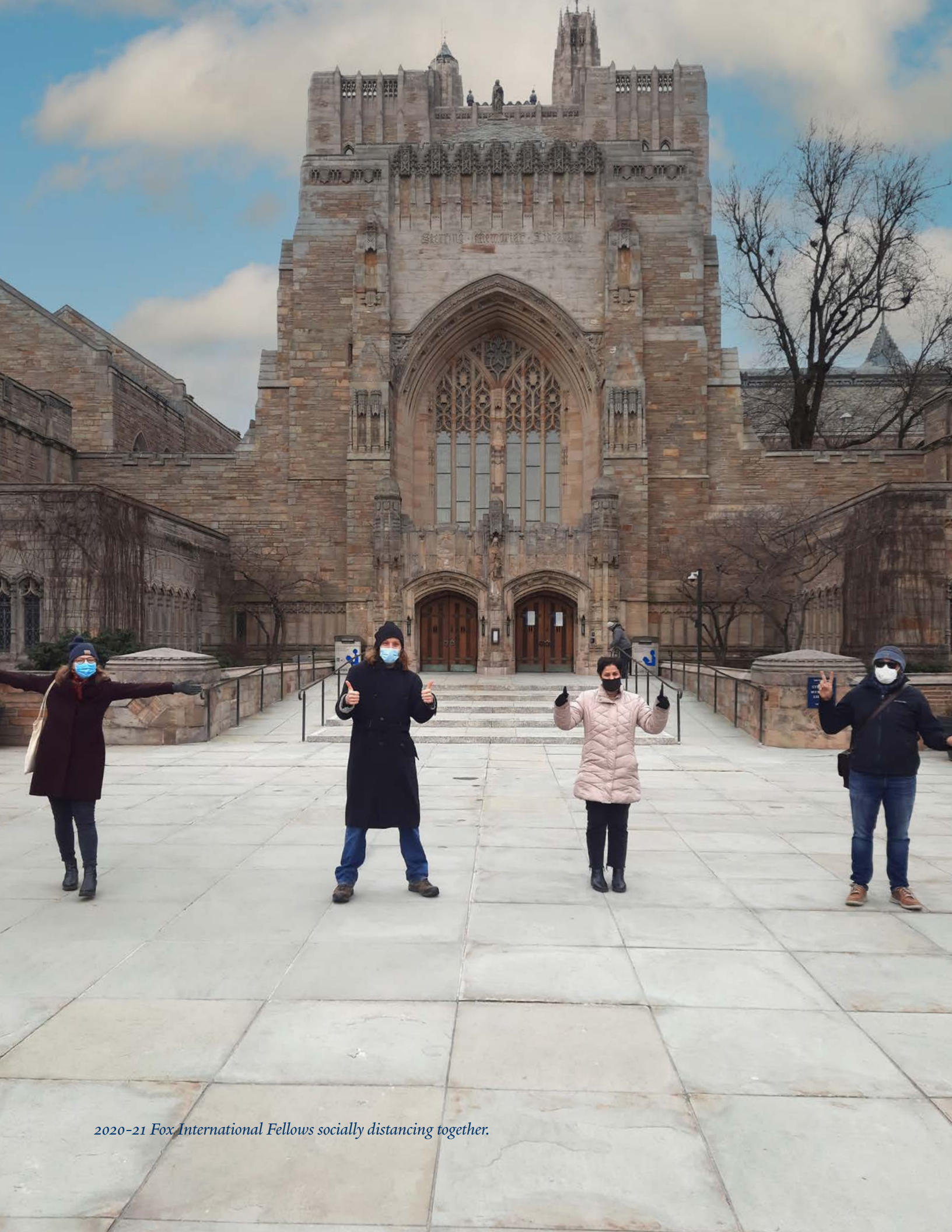
2020-21 Fox International Fellows socially distancing together.