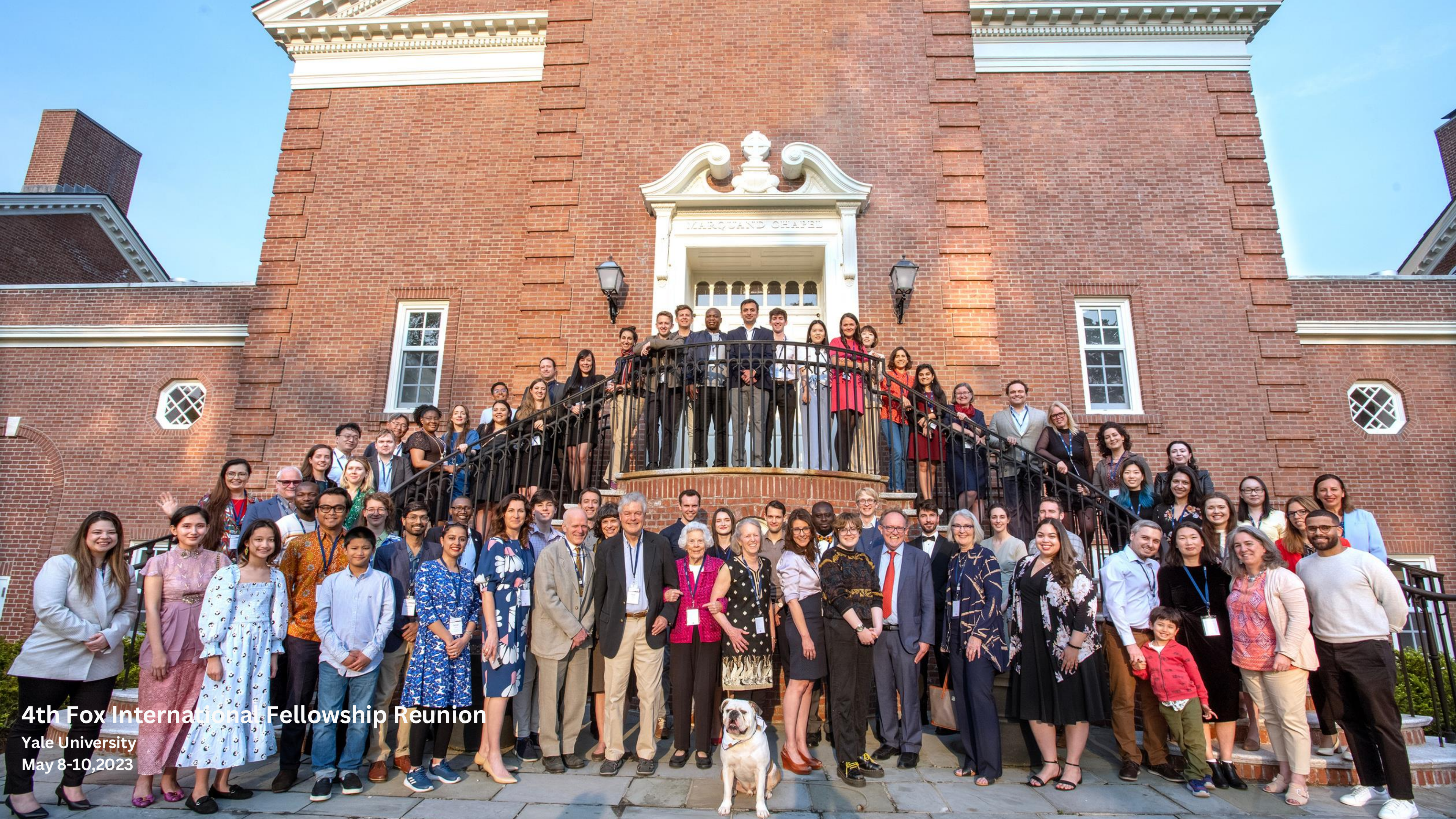
4th Fox International Fellowship Reunion Yale University May 8-10, 2023